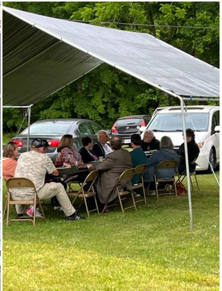
Adults go to VBS class too!