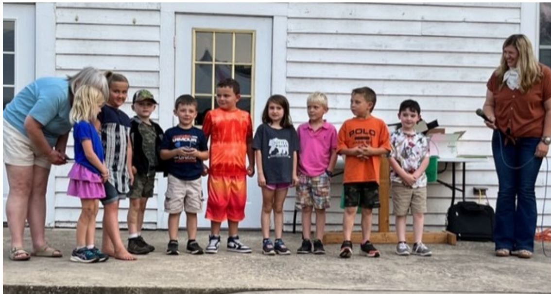
Closing VBS program