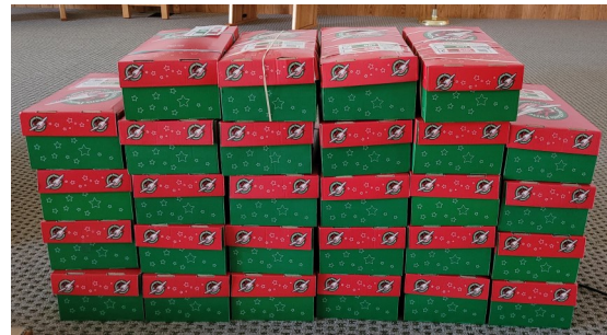
Samaritan Purse Christmas shoeboxes for children all over the world were collected for a month.