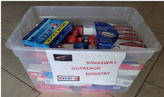
Kingsway Prison Ministry collecting toothpaste for the inmates as part of their Christmas.