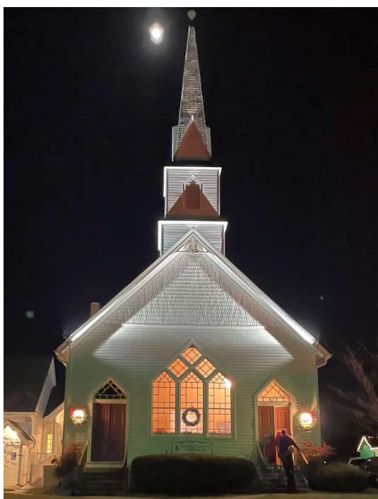
Elkton Presbyterian Church Christmas Eve Service 2023