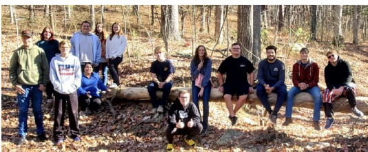
Campers explore Paddy's Run during November's Fall Retreat.