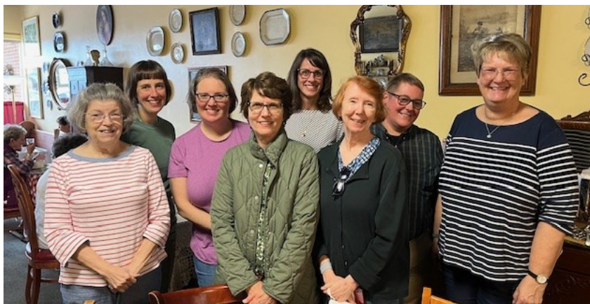
This meeting was funded by the Oasis funds.