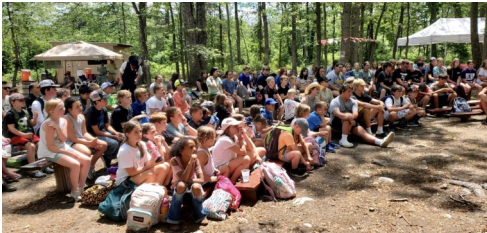
Over 140 in attendance during June's Day Camp

Camp Paddy Run had another fantastic year, continuing to build upon its strong programs and relationships. The spring season, however, saw local wild fires that devastated the lives of so many, including our own supporters and volunteers. For six weeks, Camp Paddy Run became home for a family of 9 who lost their home in the fires– and whose children attend camp. We were blessed to be able to support our campers and their families in such a big way! By May, the property was once again welcoming rental groups and hosted New Hope Church in Front Royal for a Memorial Day family camp for the third year in a row.