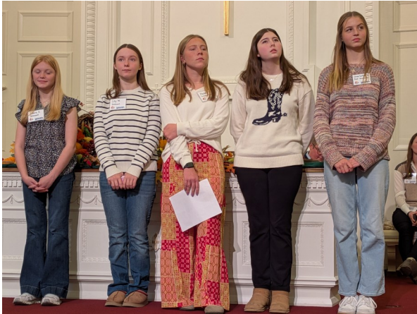
The youth of the church led worship and the Education Time.

“This was my first meeting ever on YouTube. Just wanted to thank Shenandoah Presbytery for this opportunity.”