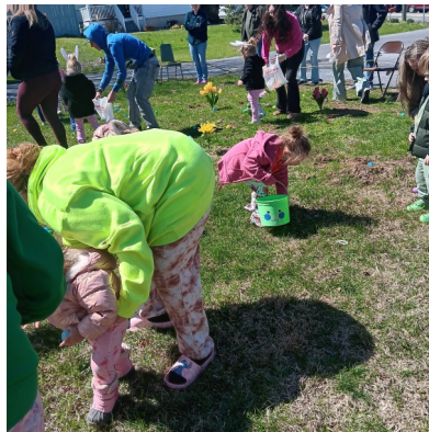
The Egg Hunt