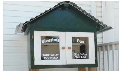
The Blessing Box at Hedgesville Presbyterian Church